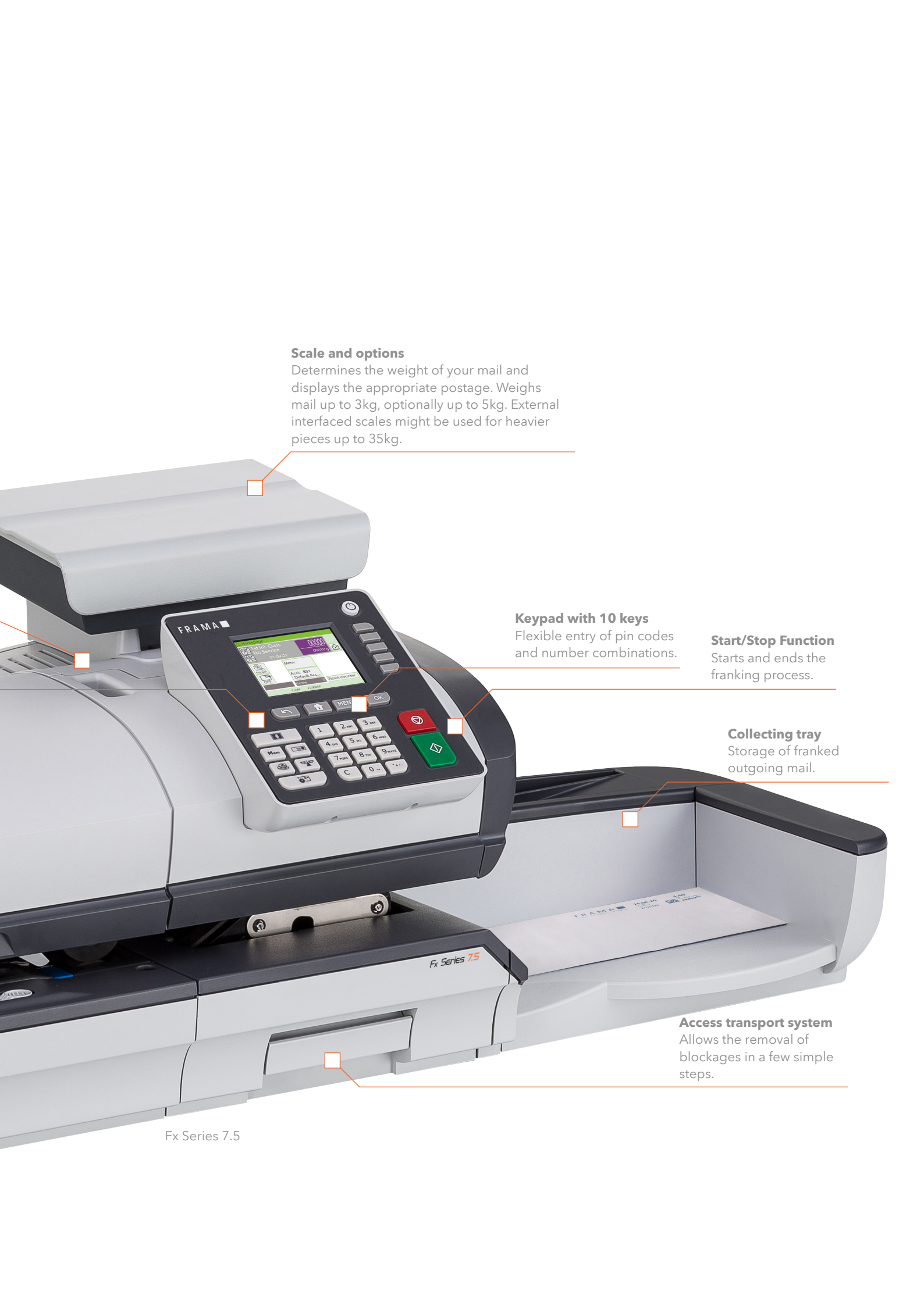
Fx Series 7.5

Allows the removal of blockages in a few simple steps.