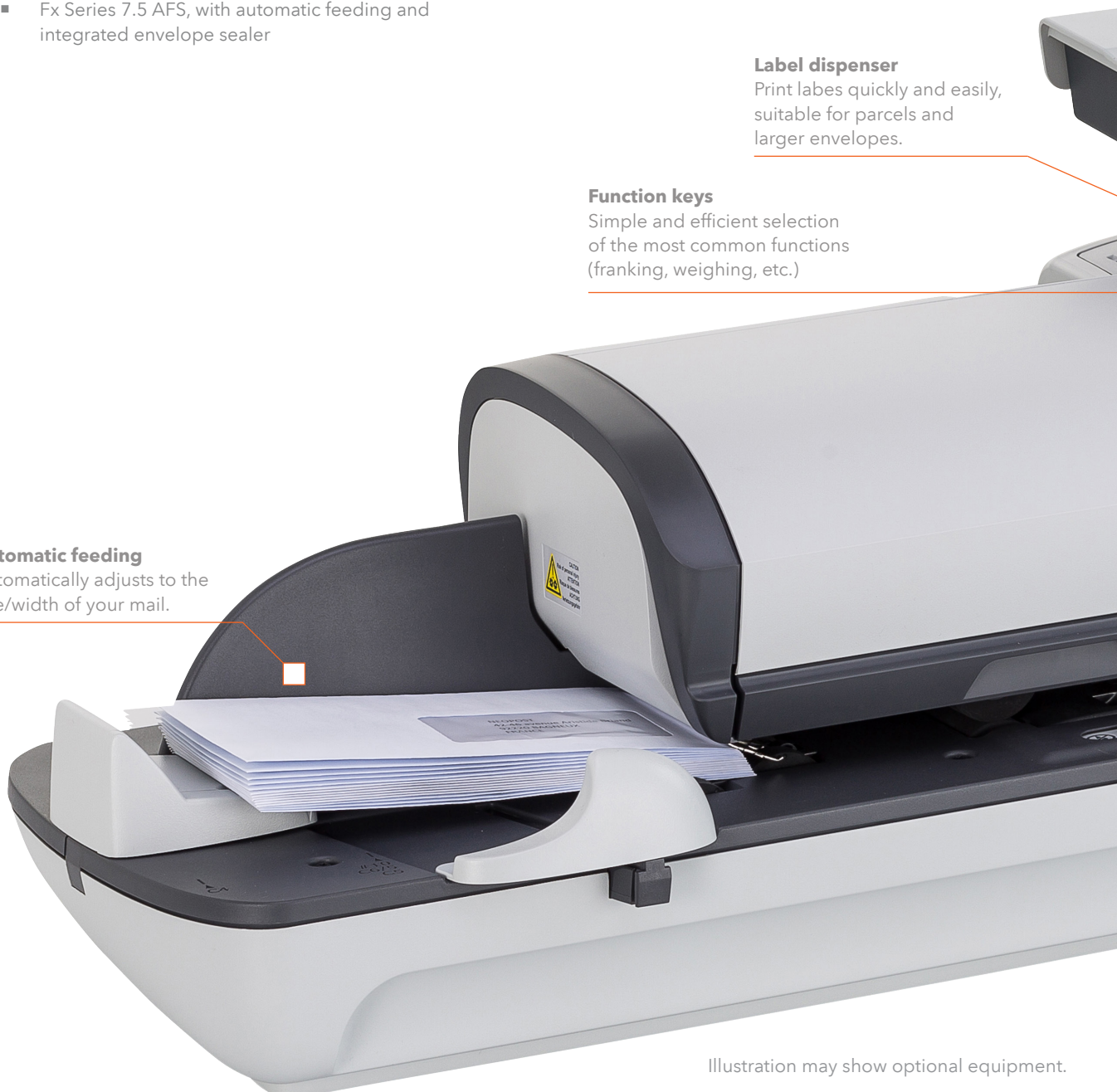
Illustration may show optional equipment.

Automatically adjusts to the size/width of your mail.