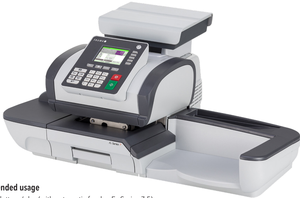
Fx Series 7