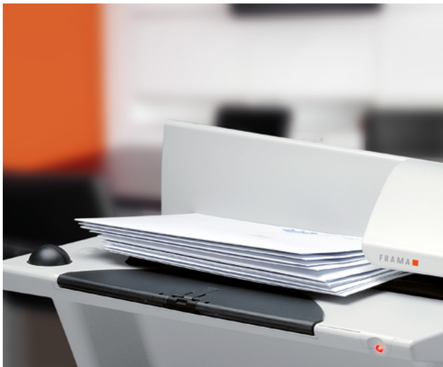
Access B400 - The only device in its class which can open envelopes up to 10 mm thick without cutting!

Those who have larger volumes of mail to handle, need to open large formats directly from the stack, those with thick mailings up to 10 mm or who need to open letters on three sides, will find the Access B400 to be indispensable.